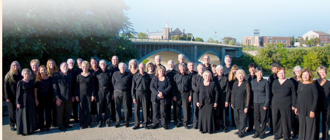
Choir photos courtesy of Celine Garneau.